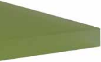
Solid NeuCast® Flat Profile