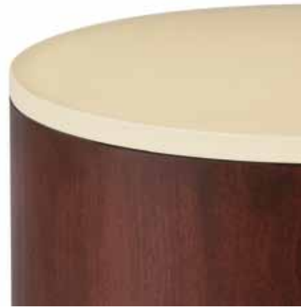
GEOS wood cylinder table detail Flat Profile (3/4" thick)