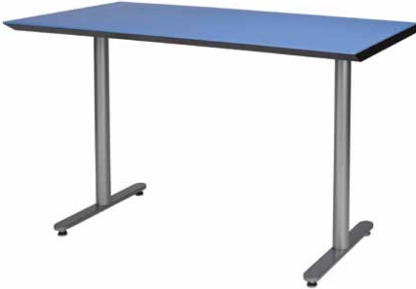
Fused NeuCast® Knife and Flat Profiles Color: #2067-40 Blue Lapis Sharon Round End T-Bases

802.244.5338 802.244.8393 Fax www.neudorfer.com info@neudorfer.com