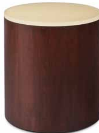
Solid NeuCast® Flat Profile (¾" thick) Color: #271 Barley Grass GEOS cherry veneer cylinder