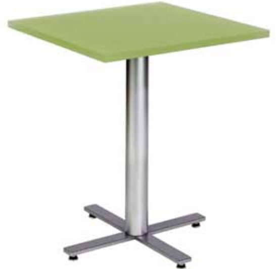
Solid NeuCast® Flat Profile (1" thick) Color: #405 Perennial Sharon Square End X-Base