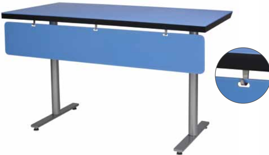
Fused NeuCast® Knife and Flat Profiles Color: #2067-40 Blue Lapis Sharon Square End T-Bases