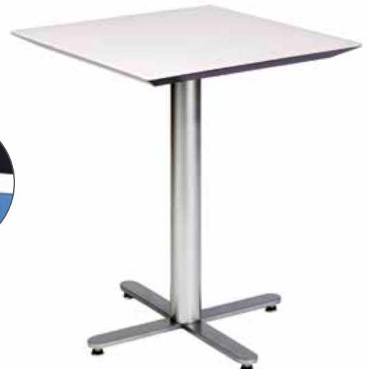
Fused NeuCast® Knife Profile Color: Superwhite Sharon Round End X-Base