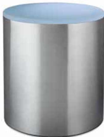
Solid NeuCast® Top Bevel Profile (¾" thick) Color: #837 Sheer Romance GEOS steel cylinder

See our web site for additional information.