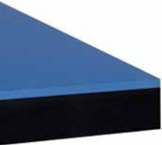
Fused NeuCast® Flat Profile