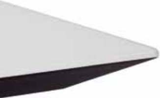
Fused NeuCast® Knife Profile